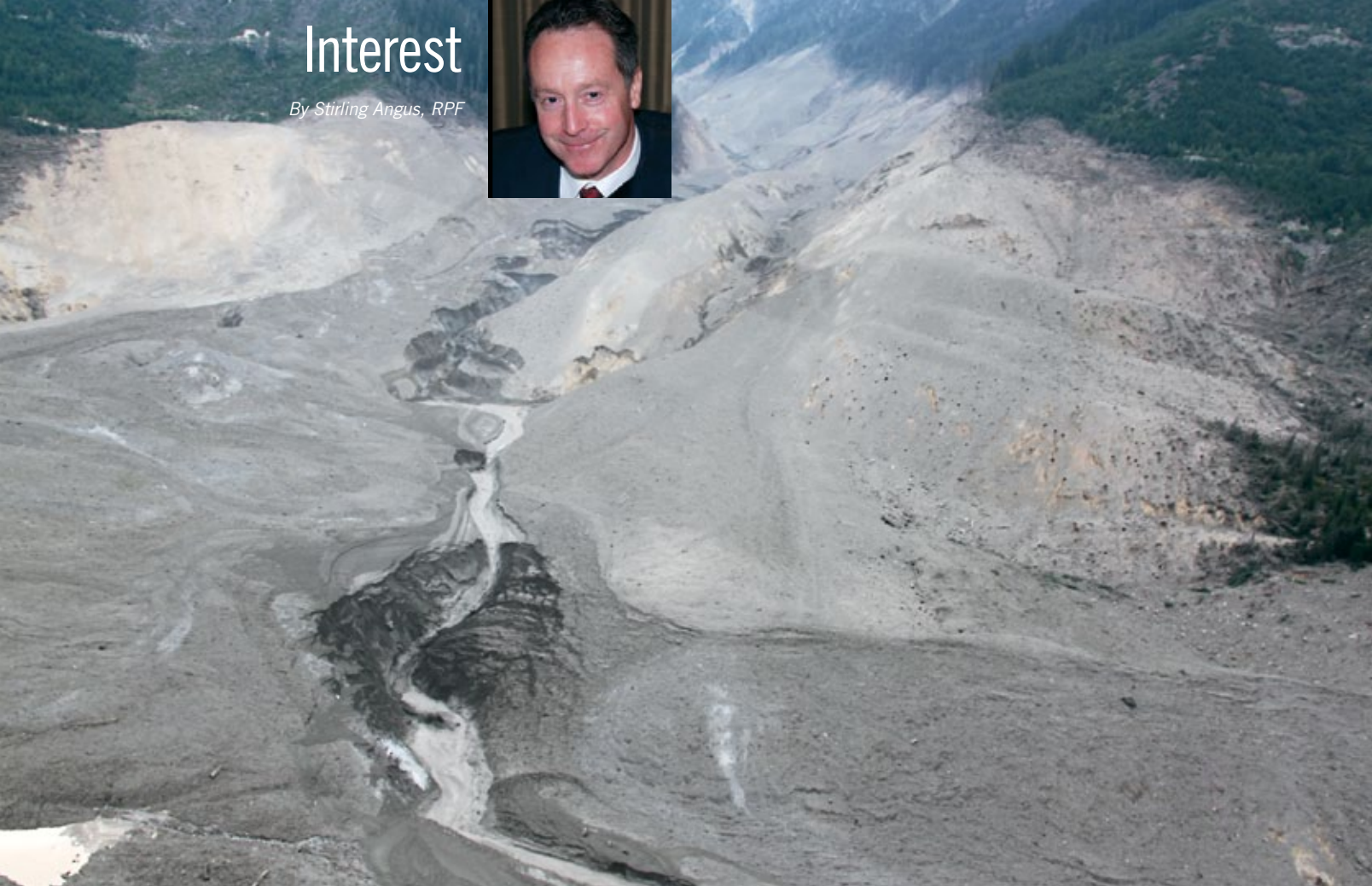
This landslide, the second largest in Canadian recorded history, obliterated five pieces of heavy equipment (not even a paint chip left) and destroyed several kilometres of road and access infrastructure.